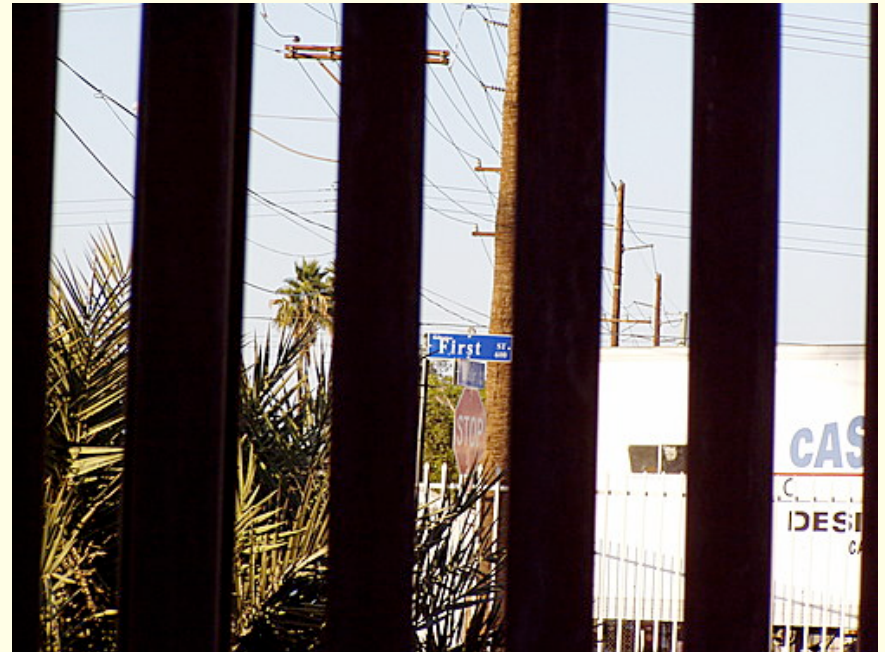
1 st Street Calexico seen through the fence from Mexicali, Mexico