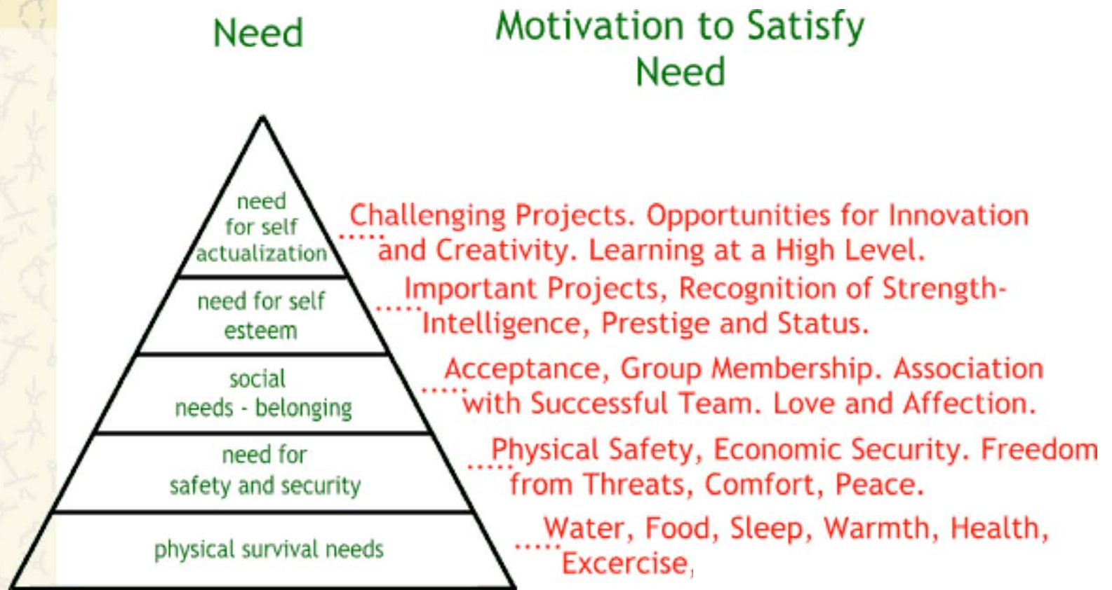
Maslow's Hierarchy of Needs